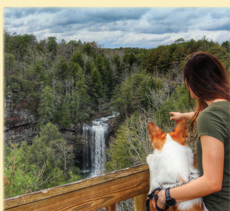
Foster Falls is located within the eastern canyon system known as Fiery Gizzard within South Cumberland State Park.