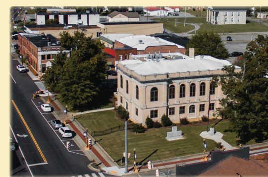
Historic Marion County Courthouse in Jasper, Tennessee

Enjoy local restaurants, shopping, historic sites and authentic Tennessee charm in Marion County, part of the national Sequatchie Valley Scenic Byway.