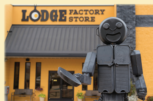
South Pittsburg is home to America's most popular cast iron cookware producer, Lodge Manufacturing. Visit their hometown Factory Store.