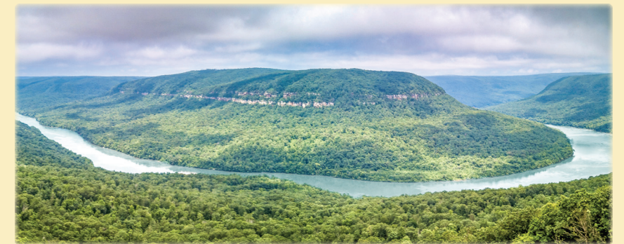
The Tennessee River winds through Marion County forming the stunning Tennessee River Gorge and Nickajack Reservoir, a popular lake for fishing and boating.