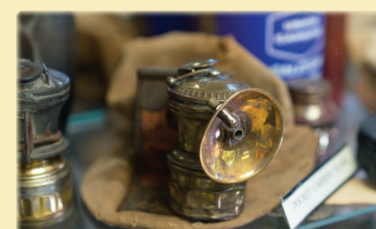
Miner's Carbide Lamp on display at the Coal Miners Museum in Whitwell.