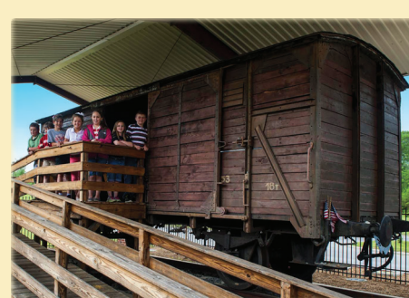
Whitwell Middle School is home to one of the world's most profound remembrances of the Holocaust, the Children's Holocaust Memorial.